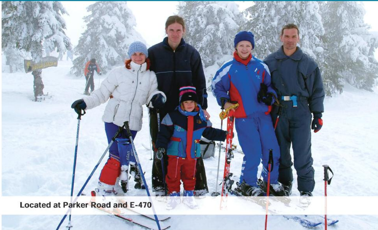
Located at Parker Road and E-470

Parker Adventist Hospital's Emergency Department is here for you and your family during those unexpected spills and chills.