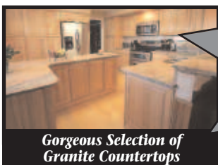
Gorgeous Selection of Granite Countertops

18 Months No Interest, No Payments - or - 10% Off Your New Cabinetry Hurry, Offer Ends Soon!