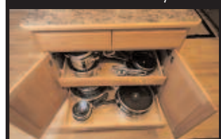
Roll-out Shelves & Many Extras